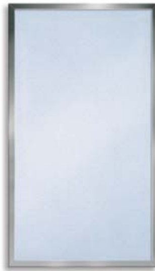
Brushed Aluminium / Frosted Glass

Alaska refreshes the popular white door using wide horizontals with a simple step detail and metallic finishing touches.