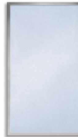
Brushed Aluminium/ Glass (plain/frosted)

Unashamedly glitzy, the Fjord range offers a selection of up to the minute high gloss finishes that can be combined to give stunning results.