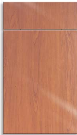
Gloss Wild Cherry