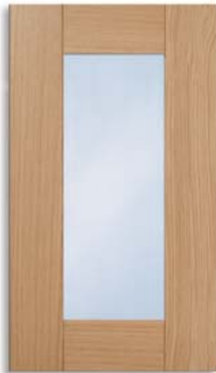
Matt Oak / Frosted Glass